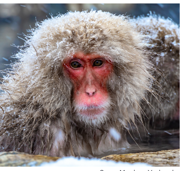
Snow Monkey, Yudanaka